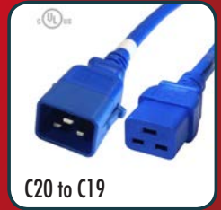
C20 to C19