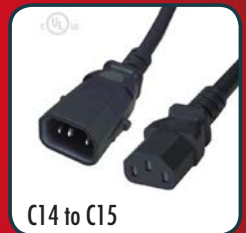
C14 to C15