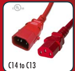
C14 to C13